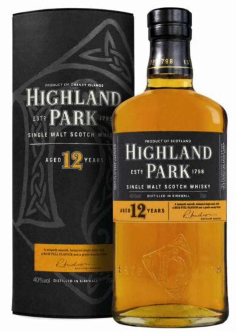
Highland Park is one of Edrington's stable.

The union says against the "backdrop of the highest cost-of-living in 40 years" and a year-long squeeze on incomes and households, its members are seeking a significantly above inflation shift allowance rate to support the basic rate of pay.