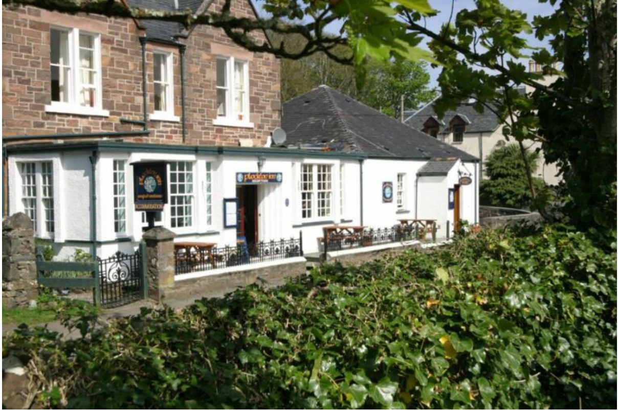
The Plockton Inn.

Last year also saw the relaunch of Royal Marine Brora, while 2023 will see the introduction of two newly refurbished properties to the collection.