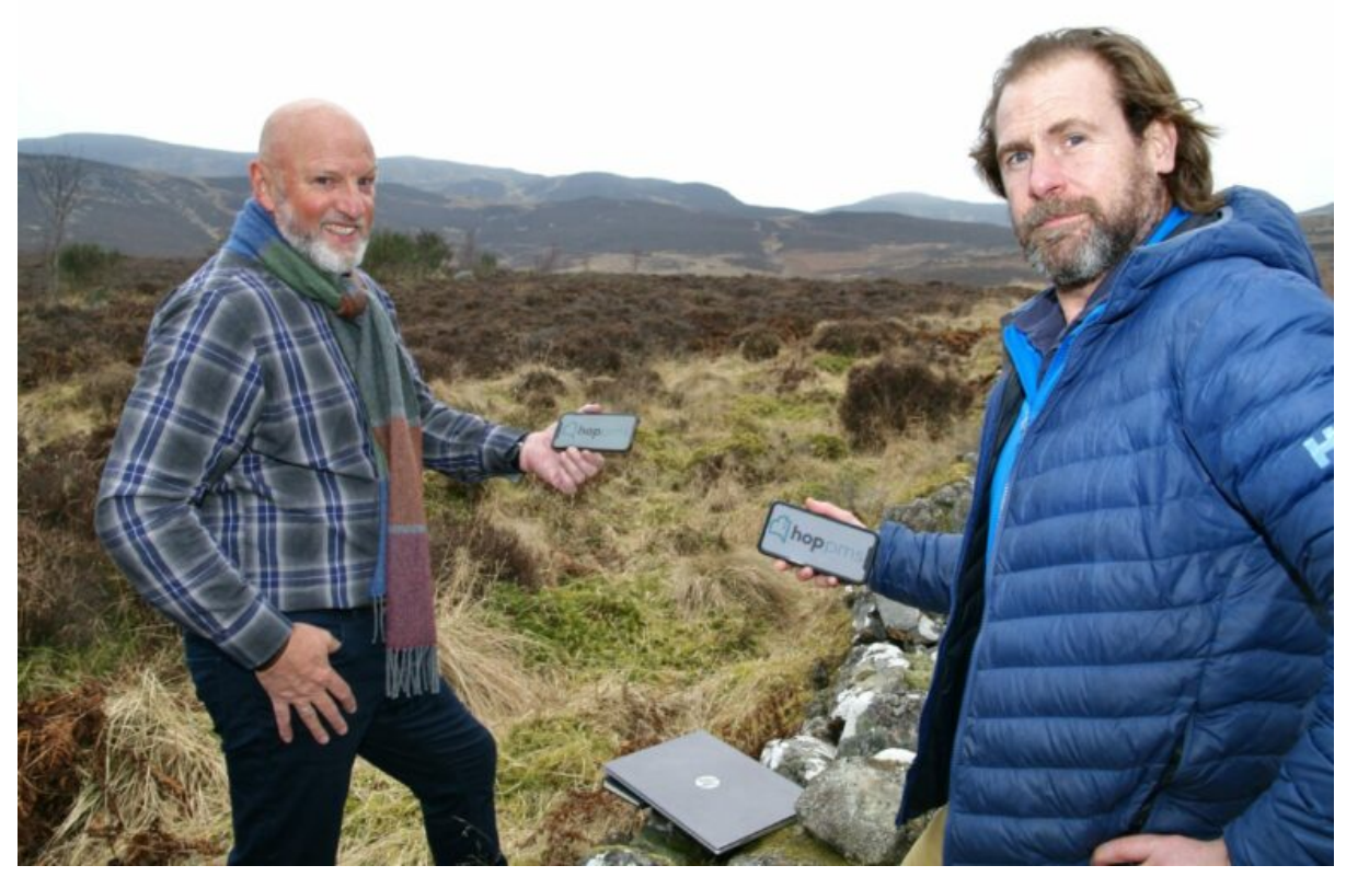
Deals now around the world.